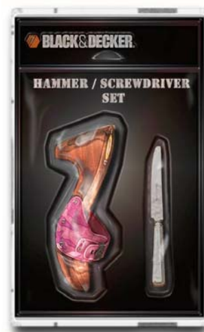
Figure out what tools you need, what it's going to cost you, how you can pay for them, and get started today. ✦

Having the Right Tools Makes All the Difference!